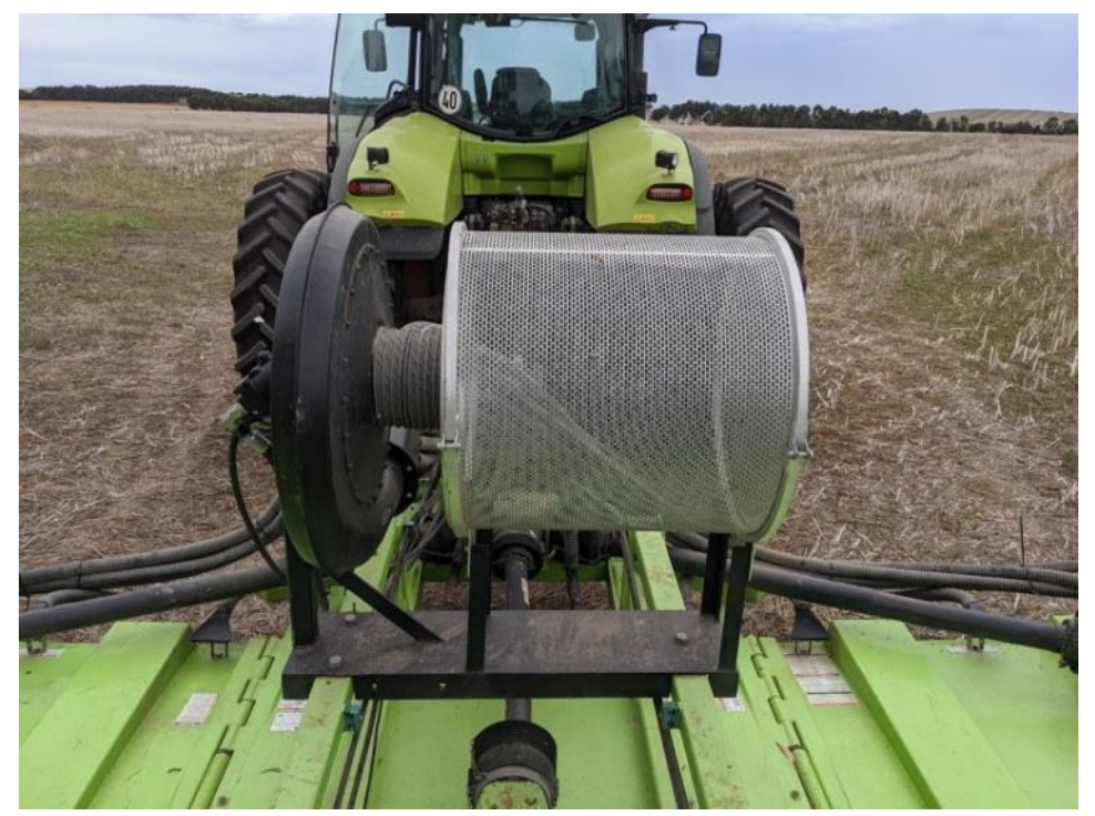
Pictured above is the Smallaire Blower Kit installed on a Slasher.