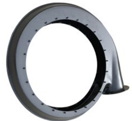
22 Series Turbo Casing