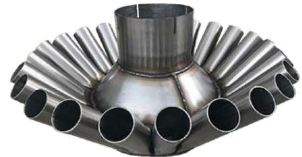
24 Outlet Primary head stainless steel.