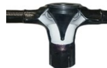
Secondary Head Tapered Rubber Cap Inside Secondary Head