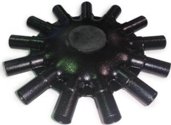
13 Outlet Secondary head Powder coated Flat cap.