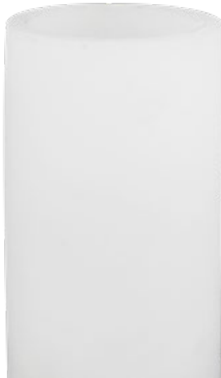
25mm LDPE-Tubing Hose