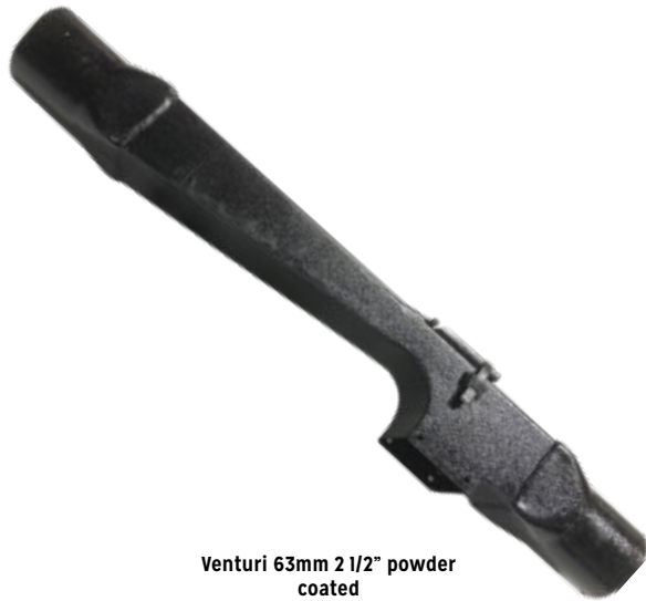
Venturi 63mm 2 1/2" powder coated