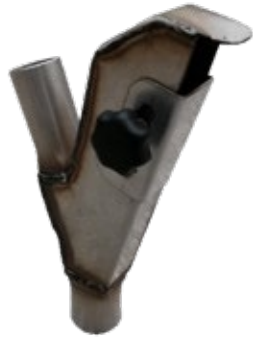
Pressure Relief Vent Single