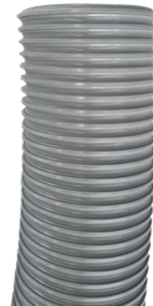
125mm TPR Rubber Duct Hose