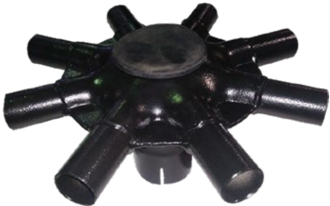
8 Outlet Secondary head Powder coated Flat cap.