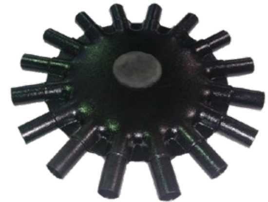
16 Outlet Secondary head Powder coated Flat cap.