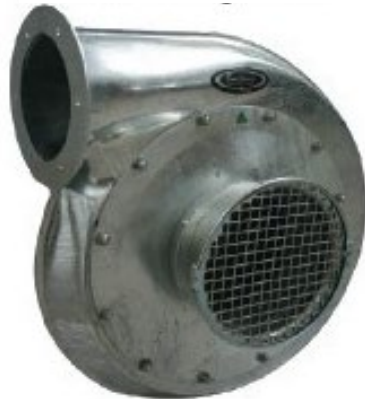
15 Series Straight Blade