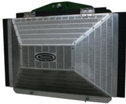
Oil Cooler—John Deere Oil Cooler front view