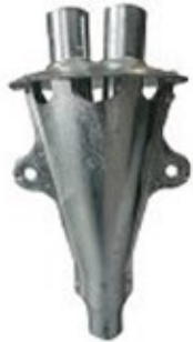
Pressure Relief Vent Twin