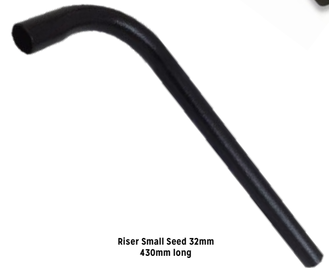
Riser Small Seed 32mm 430mm long

Available in stainless steel (extra) Mounting Bracket And Clamps Sold Separately