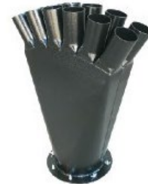
12 Outlet Blower Manifold