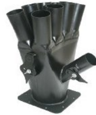
8 Outlet Blower Manifold