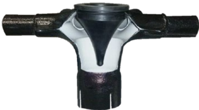
13 Outlet Secondary head Powder coated Coned cap.

Available in stainless steel (extra) Available with coned cap (extra)