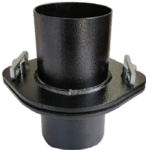
4" Quick Couple Connector

PART NUMBER DESCRIPTION RRP PER UNIT (EX. GST) AUD