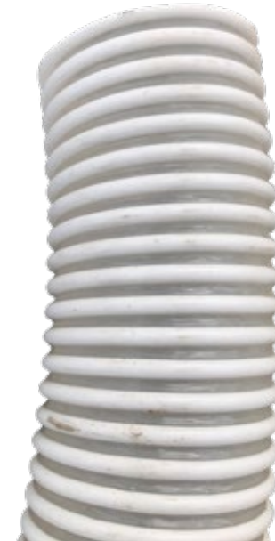
38mm Spiraflex Air-Seeder Hose