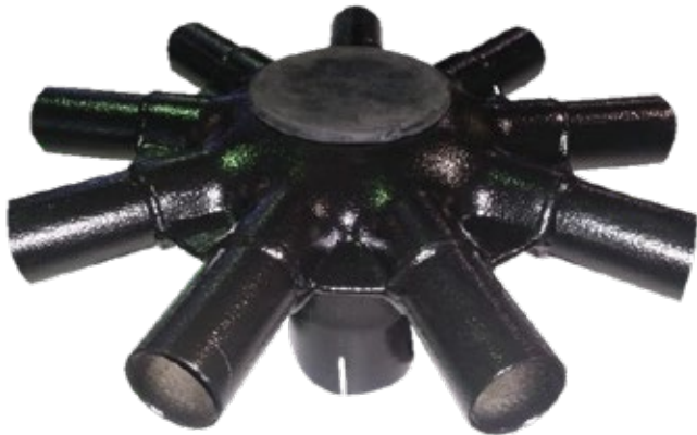
9 Outlet Secondary head Powder coated Flat cap.