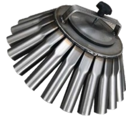
24 Outlet Primary head stainless steel.