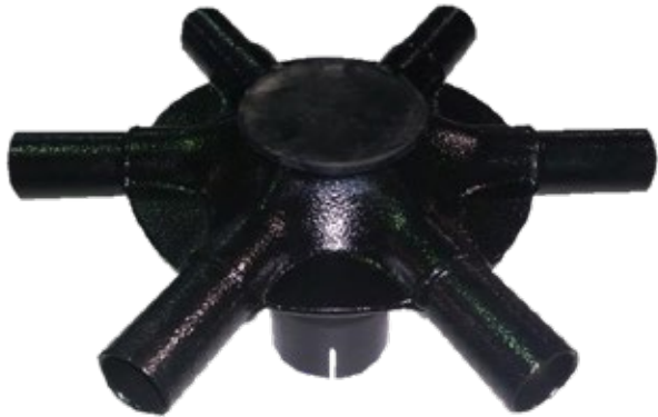
6 Outlet Secondary head Powder coated Flat cap.