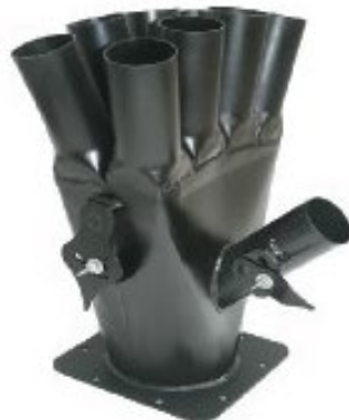
8 Outlet Blower Manifold