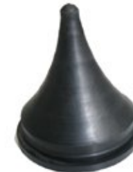
Secondary Head Tapered Rubber Cap