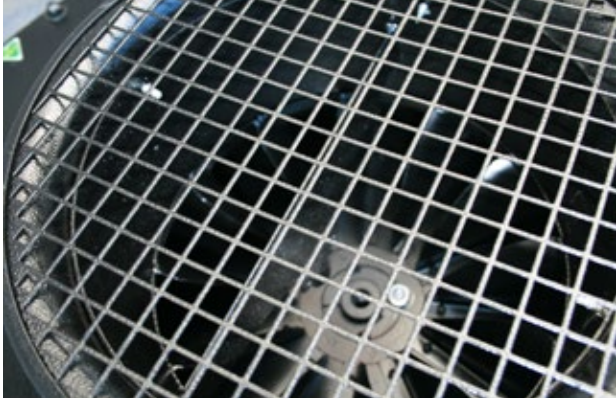
22 Series Turbo Impellor - High Pressure