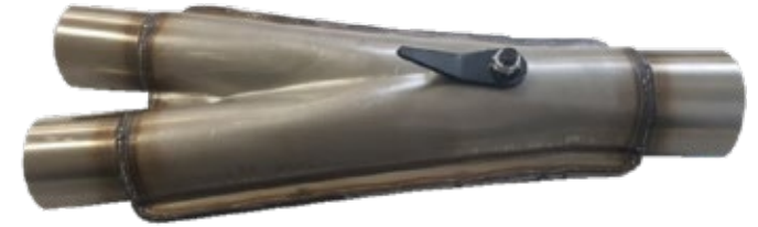
Splitter 63mm inlet 50mm outlets Stainless Steel