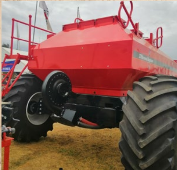
Horwood Bagshaw 22 Turbo Blower Mounted On Horwood Bagshaw Air Cart