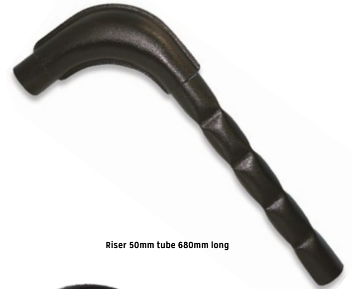
Riser 50mm tube 680mm long