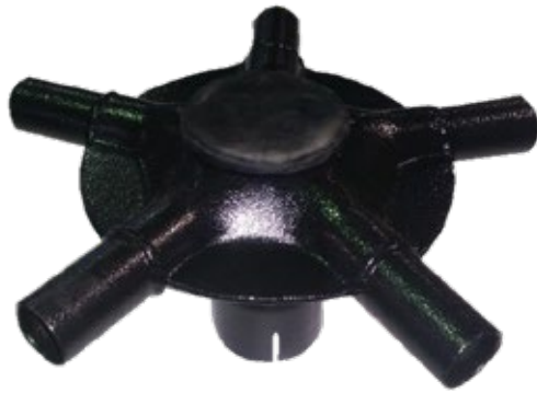
5 Outlet Secondary head Powder coated Flat cap.