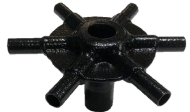
6 Outlet small seed head Powder coated