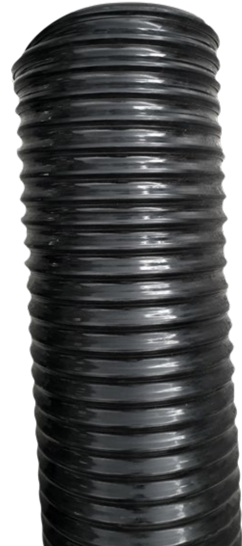
150mm NI Black Hose