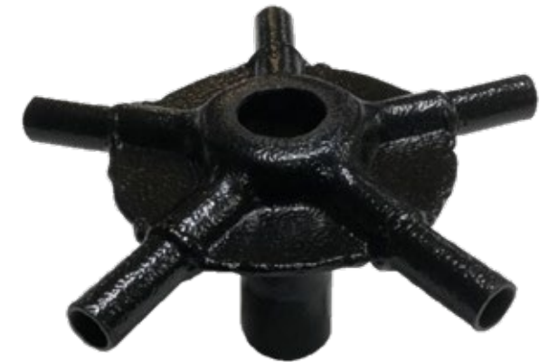
5 Outlet small seed head Powder coated