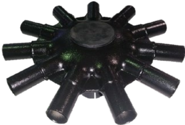
11 Outlet Secondary head Powder coated Flat cap.