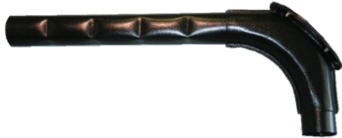
Heavy Duty Riser Powder coated