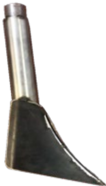
Standard Seeding Boot Raw Steel Finish