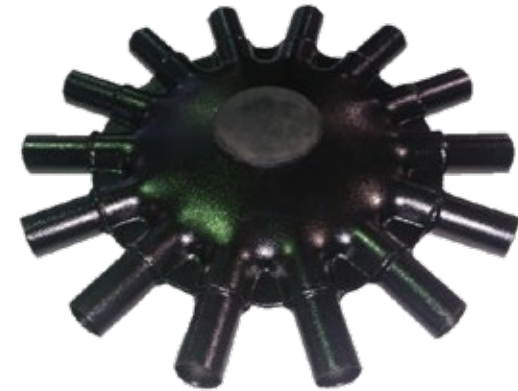
14 Outlet Secondary head Powder coated Flat cap.