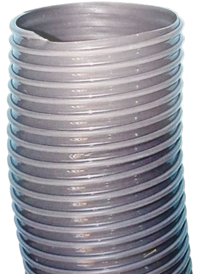
101mm PVC Pumpflex Suction Hose