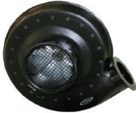
19 Series Straight Blade