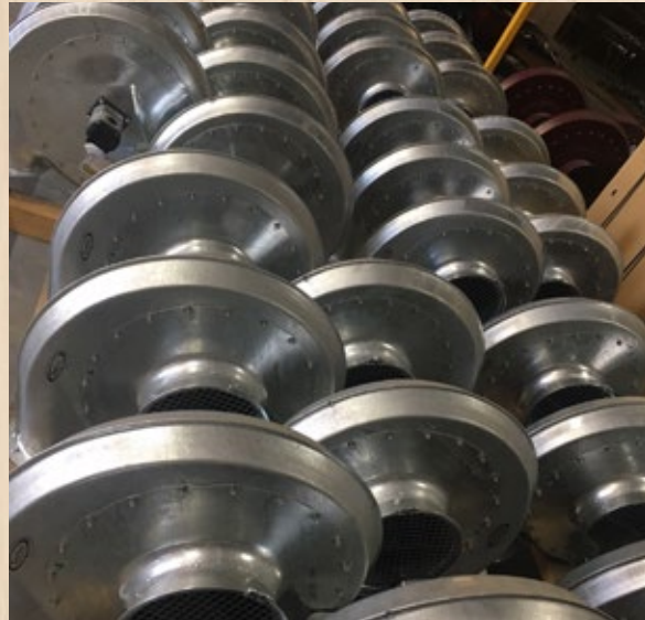
19 Series Turbo Blower's