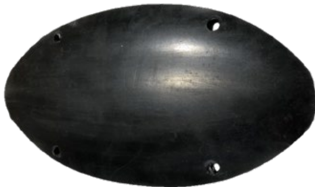
Heavy Duty Riser Rubber (Oval Wear Plate)