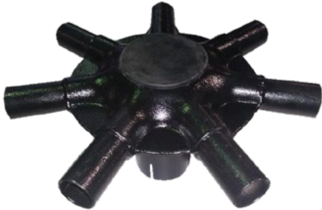
7 Outlet Secondary head Powder coated Flat cap.