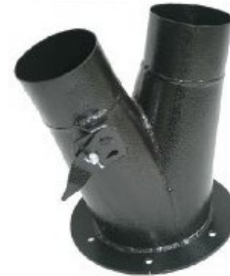
Twin Blower Manifold