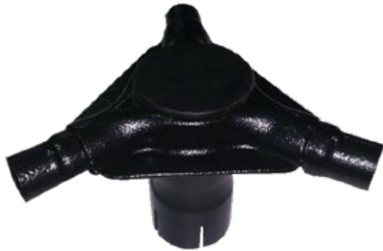
3 Outlet Secondary head Powder coated Flat cap.