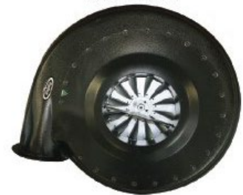
22 Series Turbo