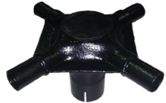
4 Outlet Secondary head Powder coated Flat cap.