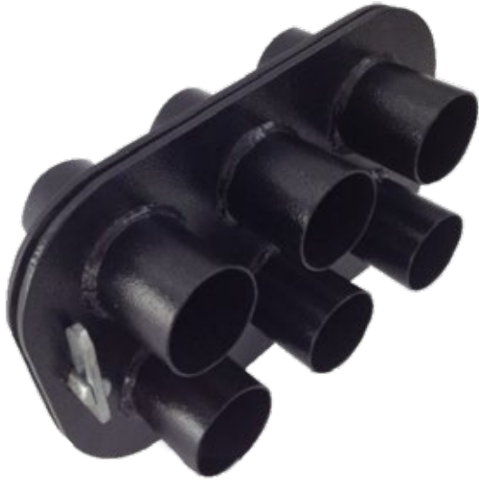
6 Way Quick Couple Connector