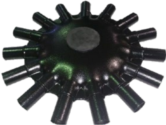
15 Outlet Secondary head Powder coated Flat cap.