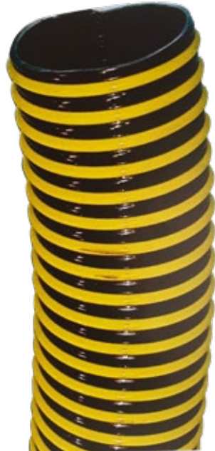
150mm Tiger Tail Air Seeder Hose