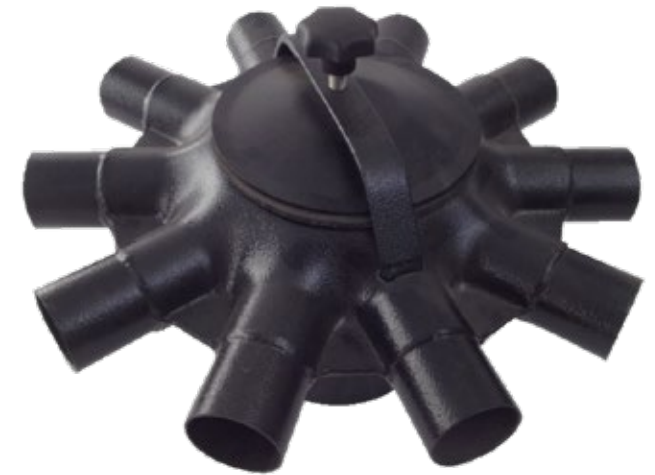
10 Outlet Primary head Powder coated steel