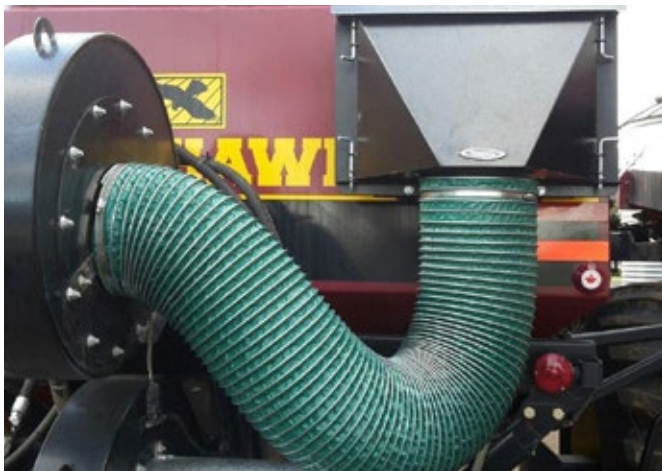
Oil Cooler—Universal Kit Complete 250mm