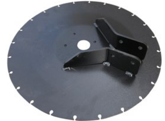
22 Series Turbo Motor Plate