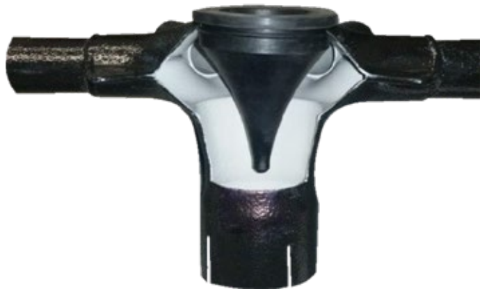
5 Outlet Secondary head Powder coated. Coned cap.

Available in stainless steel (extra) Available with coned cap (extra)