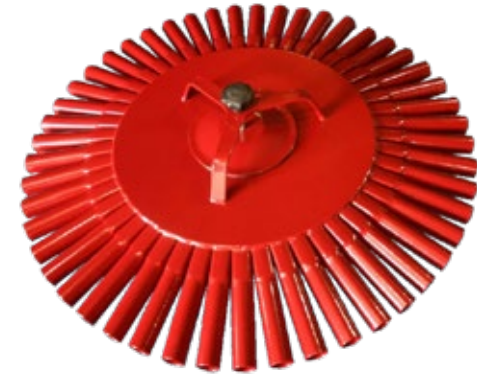
49 Outlet Primary head Powder coated steel.