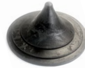
Large Primary Head Tapered Rubber Cap