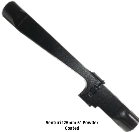
Venturi 125mm 5" Powder Coated

Available in stainless steel (extra) Mounting Bracket And Clamps Sold Separately