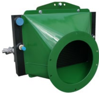
Oil Cooler- John Deere Oil Cooler - Rear