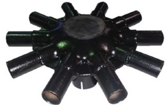
10 Outlet Secondary head Powder coated Flat cap.