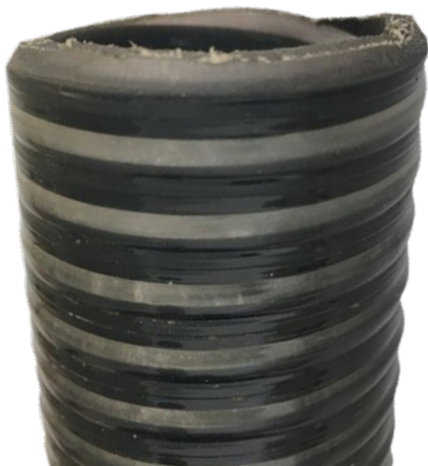
32mm PVC Air Seeder Hose