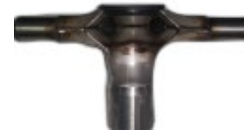
Secondary Head Flat Rubber Cap Inside Secondary Head