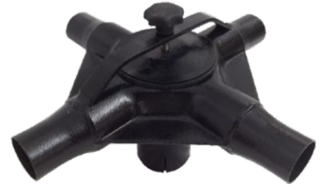
4 Outlet Primary head Powder coated steel