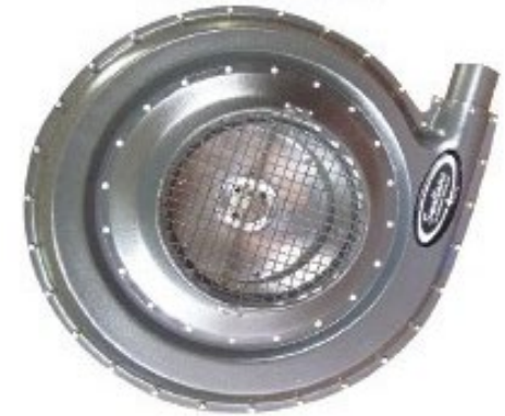
19 Series 3" Outlet