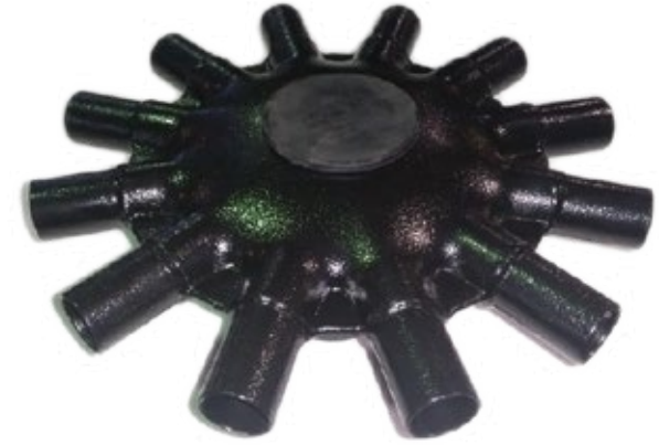
12 Outlet Secondary head Powder coated Flat cap.