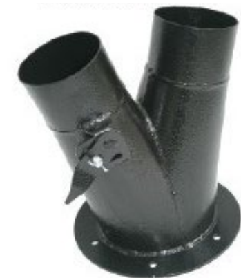
Twin Blower Manifold

PART NUMBER DESCRIPTION RRP PER UNIT (EX. GST) AUD