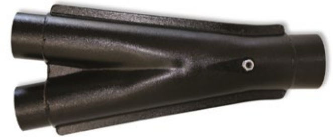
Splitter 75mm inlet 63mm outlets

Available in stainless steel (extra) Splitter Mounting Bracket Option Available